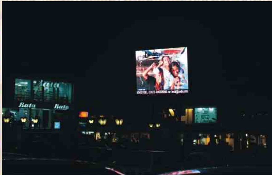
Wetlands promotion on giant screen in Jinnah Super Market, Islamabad

With the initiation of the 'Wetlands Gala' on 2 nd February, banners, pole flexes and bridge hoardings