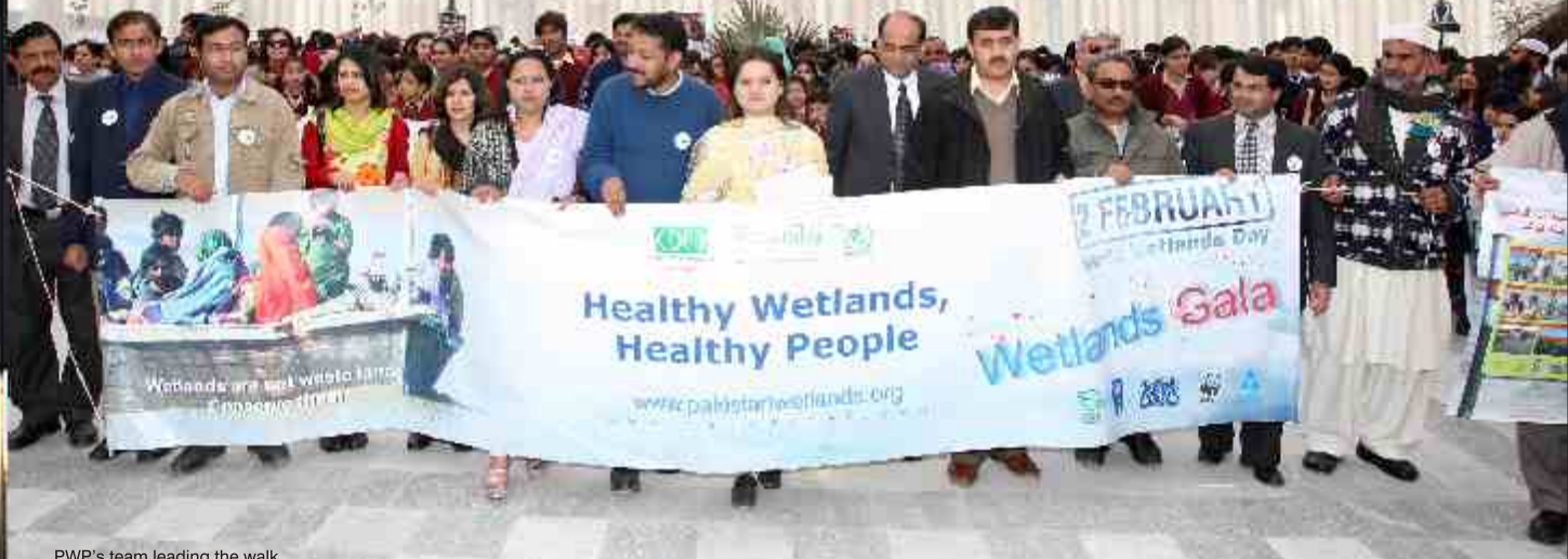
PWP's team leading the walk