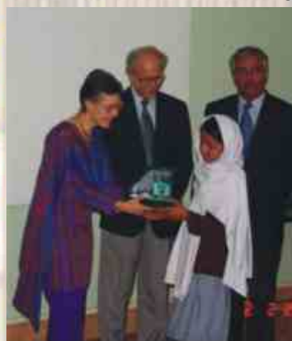
Prize distribution ceremony.

The event provided a good opportunity for students and teachers of Government and private schools from Karachi to understand about numerous aspects of wetlands. They illustrated their understanding