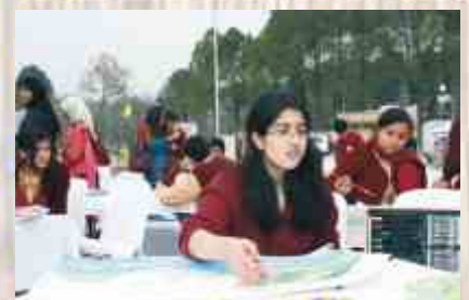
A student busy in art work.

Moreover, the Wetlands Gala 2008 received a noteworthy coverage on various national and international TV channels. A total of 25 TV channels such as Dawn TV , Geo TV , ARY One , Aaj, Waqt , Khyber TV , Apna TV , Indus TV aired wetlands related programmes throughout the week. The documentary ' Healthy Wetlands Healthy People ', especially