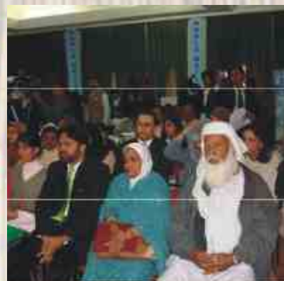
Guests on WWD 2008 at Sandspit Karachi.

about the role of functioning wetlands ecosystems in maintaining human health. They also demonstrated their commitment towards wetlands conservation by participating