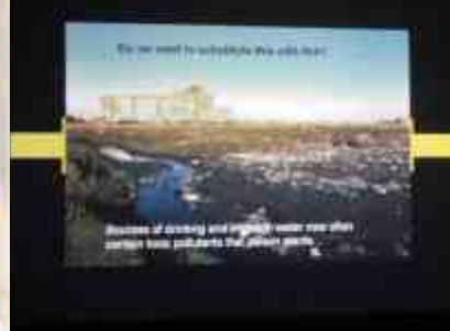
Screen shot of wetlands promotional slides.

A promotional video titled Explore Wetlands of Pakistan illustrates the overwhelming beauty of the significant wetlands in all four complexes of the Pakistan Wetlands Programme i.e. Northern Alpine