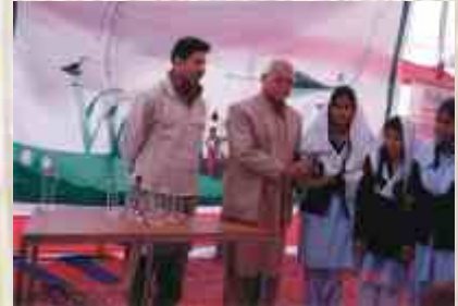
Prize distribution ceremony at CIWC.

knowledge regarding the importance of wise-use of wetlands. Students, teachers and parents showed great enthusiasm and interest in all the activities.