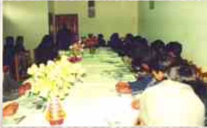
Press conference at NAWC.