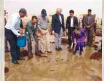
Turtle hatchlings being released.

The release of turtle hatchling into the sea was another activity in the series of events. The activity was carried out at Sandspit Beach near the Wetlands Centre in Karachi. The