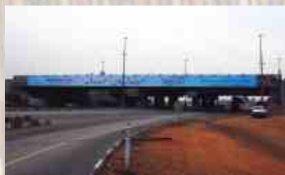
A public message on Faizabad bridge, Rawalpindi

Highway and the bridges of 7 th Avenue. Banners were also displayed along main roads of Islamabad like Kashmir Highway, Blue area, Club Road, Rawal Lake Road and prominent market places