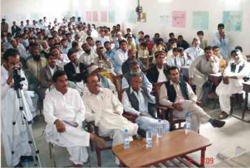
WWD 2008 Jiwani, MCWC.

A week-long festive celebration was held at MCWC to mark the World Wetlands Day 2008 and raise awareness about the theme for this year 'Healthy Wetlands Healthy People'. The activities included: