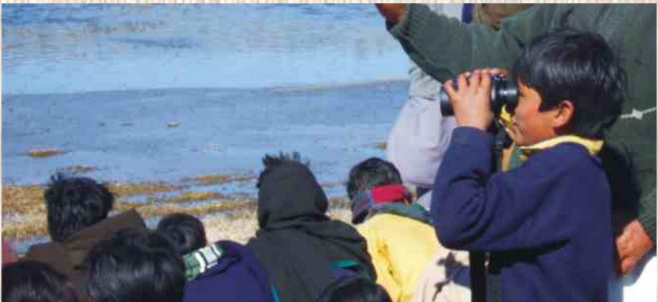
Student enjoys bird watching at Khabbeki lake.