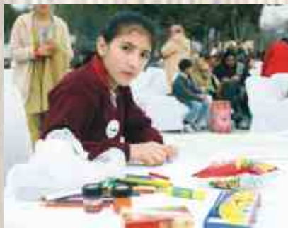
An Art competition participant.

940 students in Islamabad, 125 in Lahore and 365 in Karachi participated in the arts competition. The scenic Rawal Lake View Park was the venue in Islamabad and provided an ideal backdrop for the event where hundreds of students from government and private