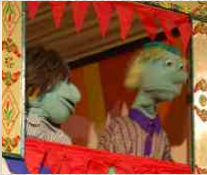
Puppets discussing the significance of wetlands.

enjoyed the colourful show and clapped excitedly to the title song 'Jhilmilati Machlian'.