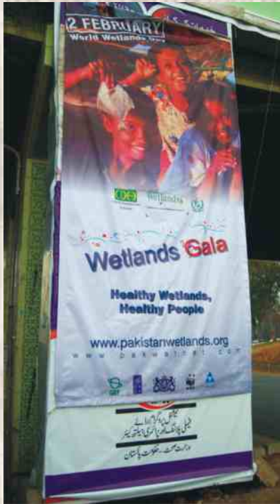
Pole Flex for outdoor awareness.

including Jinnah Super, Super Market, F-10 Markaz etc. Slogans like Wetlands are not wastelands conserve them... , Healthy Wetlands Healthy People... Our Wetlands Our Responsibility were seen on these banners. This outdoor awareness was courtesy of Capital Development Authority as the PWP had to pay no charges for acquiring these spots and thus received free publicity and mileage.