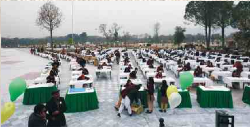
Essay competition at Rawal Park.

940 students in Islamabad, 125 in Lahore and 365 in Karachi participated in the arts competition. The scenic Rawal Lake View Park was the venue in Islamabad and provided an ideal backdrop for the event where hundreds of students from government and private