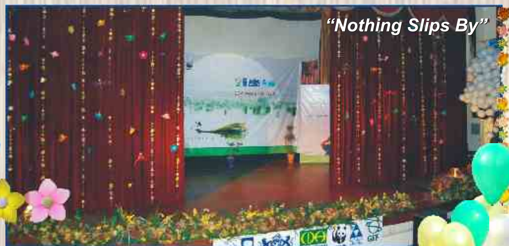
Opening ceremony of WWD 2008 Gala.

The monthly newsletter of the Pakistan Wetlands Programme (PWP) is published to inform donors, scientists, academics, researchers, environmentalists and environmentally concerned individuals of all qualifications and ages about the Programme, its projects and upcoming events while giving insights and updates on research, education, and habitat management activities. The PWP's objective is to conserve the globally important wetlands biodiversity in Pakistan while alleviating poverty. It is a progressive initiative of the Federal Ministry of Environment and is being implemented by the World Wide Fund for Nature, Pakistan (WWF P). It is funded by a consortium of national and international donors including, the Global Environment Facility (GEF), United Nations Development Programme (UNDP), the Royal Netherlands Embassy (RNE), WWF Global Network and the Pakistan Poverty Alleviation Fund (PPAF).