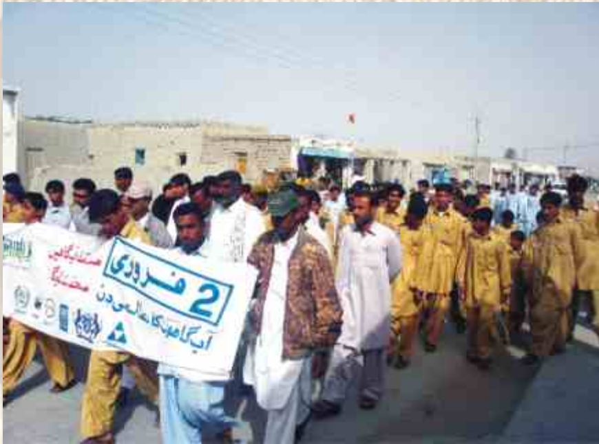
Advocacy walk at Jiwani, MCWC.

Council, government departments, NGOs etc.