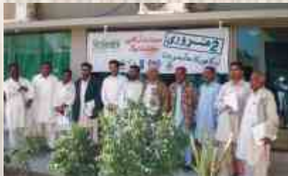
Media seminar at Jiwani, MCWC.

MCWC organised a seminar for print and electronic media