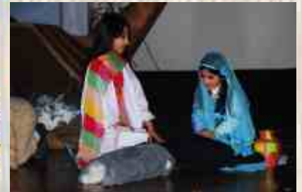
Play performance on clean drinking water.

Its Never too Late performed by students of Roots School depicted the future of Pakistan in 2012 as environment sensitive country and livelihood dependence of fishermen