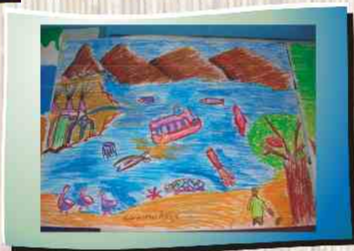
Painting submitted by students for WWD 2008.