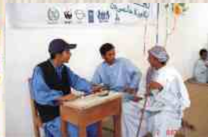
Play performance at Gwadar.

Gwadar, chaired the event and in his speech stressed the importance of having healthy wetlands to ensure human well-being. He appreciated