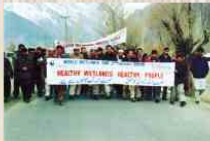
Advocacy walk in scenic wetlands ecosystems.

picturesque surroundings while observing the wetlands ecosystems and their associated biodiversity.