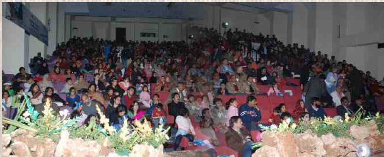
Audience at closing ceremony of WWD 2008.