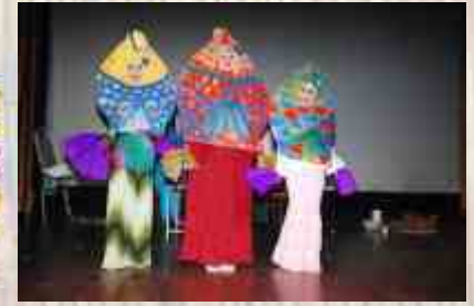
Play performance on WWD 2008.

Participating schools gave live presentations explaining their models, recognising species and habitats, and explaining issues related to the wetlands. The contribution of the PWP in alleviating the problems of wetlands and spreading awareness was appreciated.