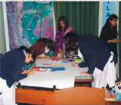
Art competition held in Karachi.

Arts Competitions were held earlier in 18 towns involving more than 1600 schools of the City District Government Karachi. The