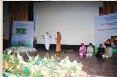
Play performance at Islamabad Club.

Lets Make Their Joy Last was a thought provoking play by students