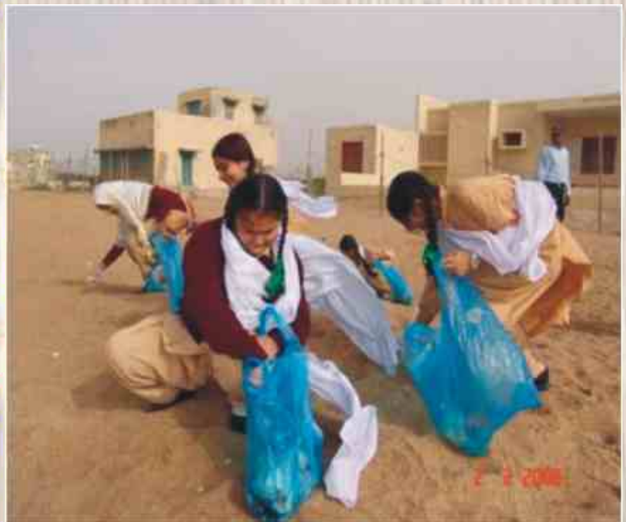
Beach cleaning at Sandspit, Karachi.