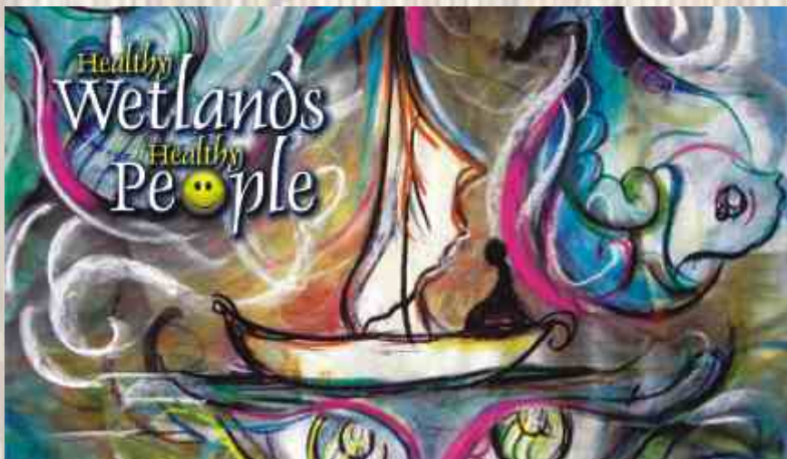
First prize winner for healthy wetlands, healthy people art competition.

country in line with the theme of the competition - 'Healthy Wetlands, Healthy People'. Teachers from both government and private schools enthusiastically participated in the competition.