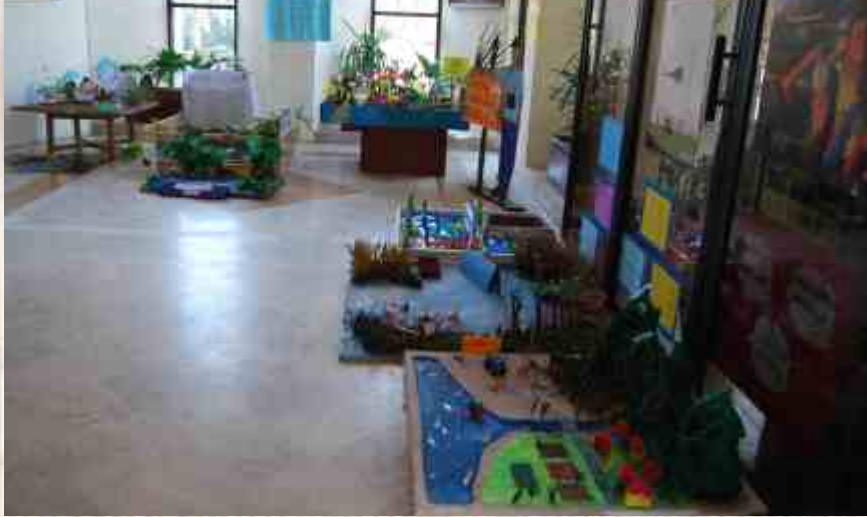
3-D model display at Islamabad Club, WWD 2008.

The interactive wetlands models displayed at Islamabad Club on 9 th