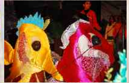
Children dressed as wetlands species.

This year government and private schools from Islamabad and Rawalpindi eagerly participated in the 'Healthy Wetlands, Healthy People' play performances at Islamabad Club. A total of six plays were performed by various schools/colleges which were viewed with great interest by the audience. A brief synopsis of the plays is given below: