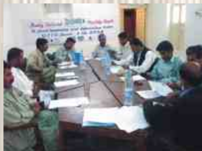
Press briefing on WWD 2008, MCWC

the MCWC organised a group discussion for the youth of Jiwani at the WWF-P Jiwani Conservation and Information Centre. A team of PWP gave short presentations on wetlands related topics such as the