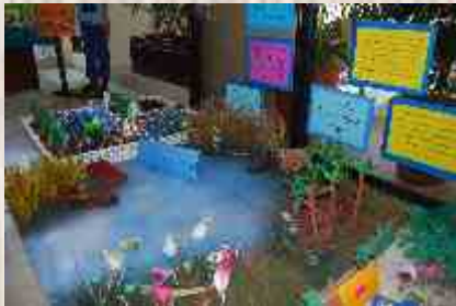
3-D model display by students, WWD 2008.

and 10 th February were surrounded by curious visitors and onlookers. These 3-D model exhibits were