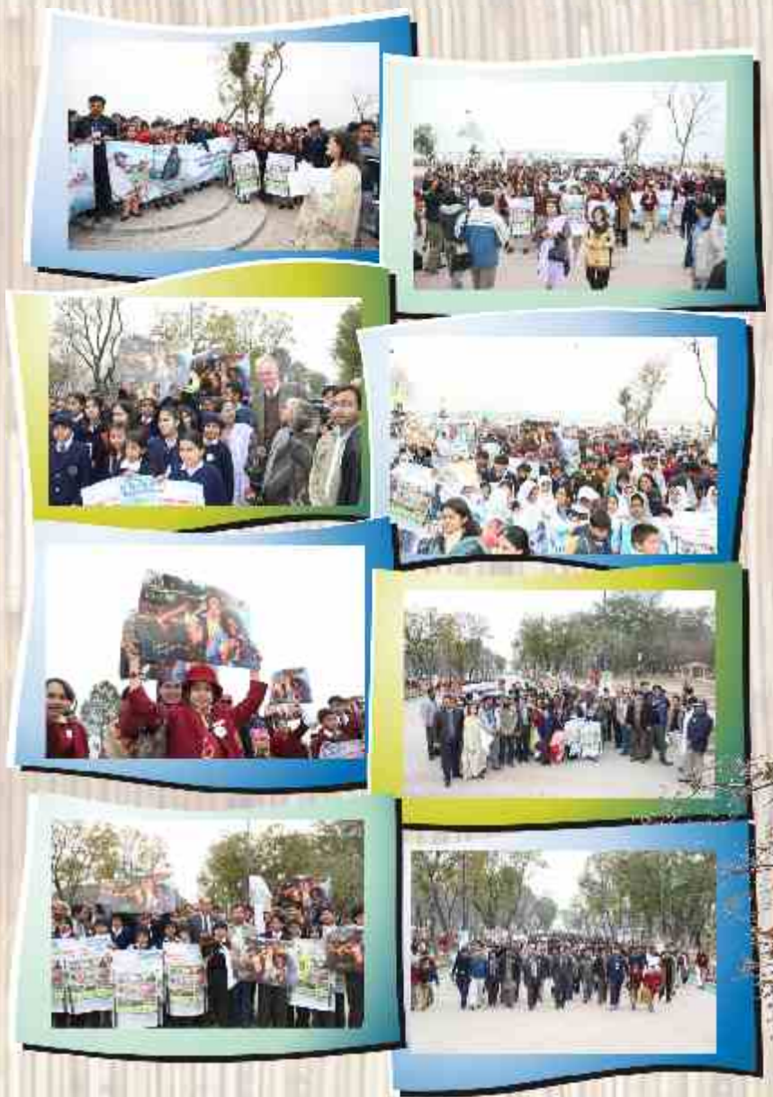
Glimpses of healthy wetlands, healthy people advocacy walk.

The advocacy walk received extensive media coverage especially in newspapers, and thus, spread the message of wetland conservation not just among the participants, but also among the general masses.