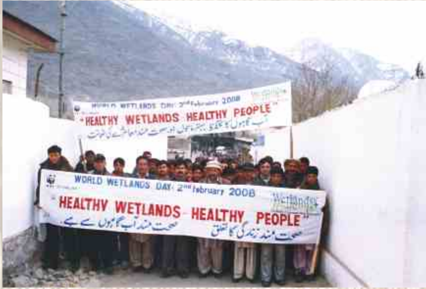
Advocacy walk in Ghizer District, Northern Areas.

The Northern Alpine Wetlands Complex celebrated the WWD 2008 by organising various activities in the regions of District Swat, District Chitral and the Northern Areas of Pakistan.