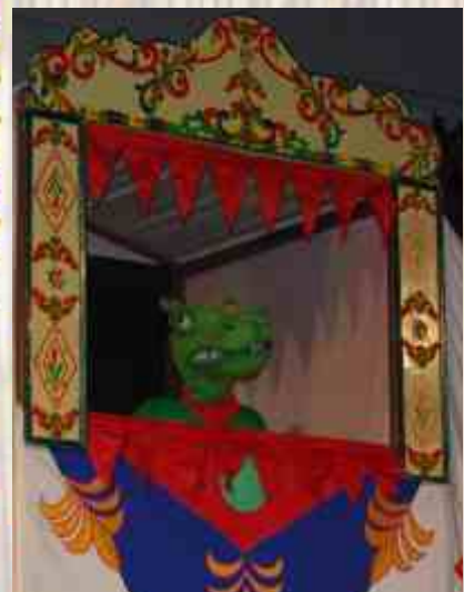
Grumpy croc educates the people on wetlands.

infotainment in awareness-raising, the PWP invited renowned puppeteers Rafi Peer Theatre Workshop from Lahore to present a