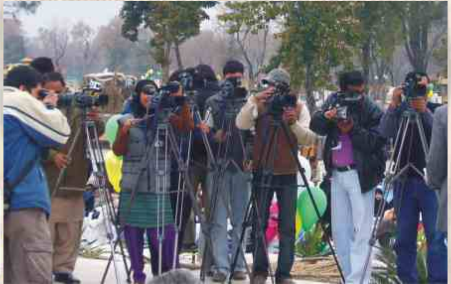
Media representative eager to cover inauguration WWD 2008, Rawal Park.

prepared by the PWP Awareness-raising team was shown by most channels in addition to discussions, panel talks and interviews on environmental issues.