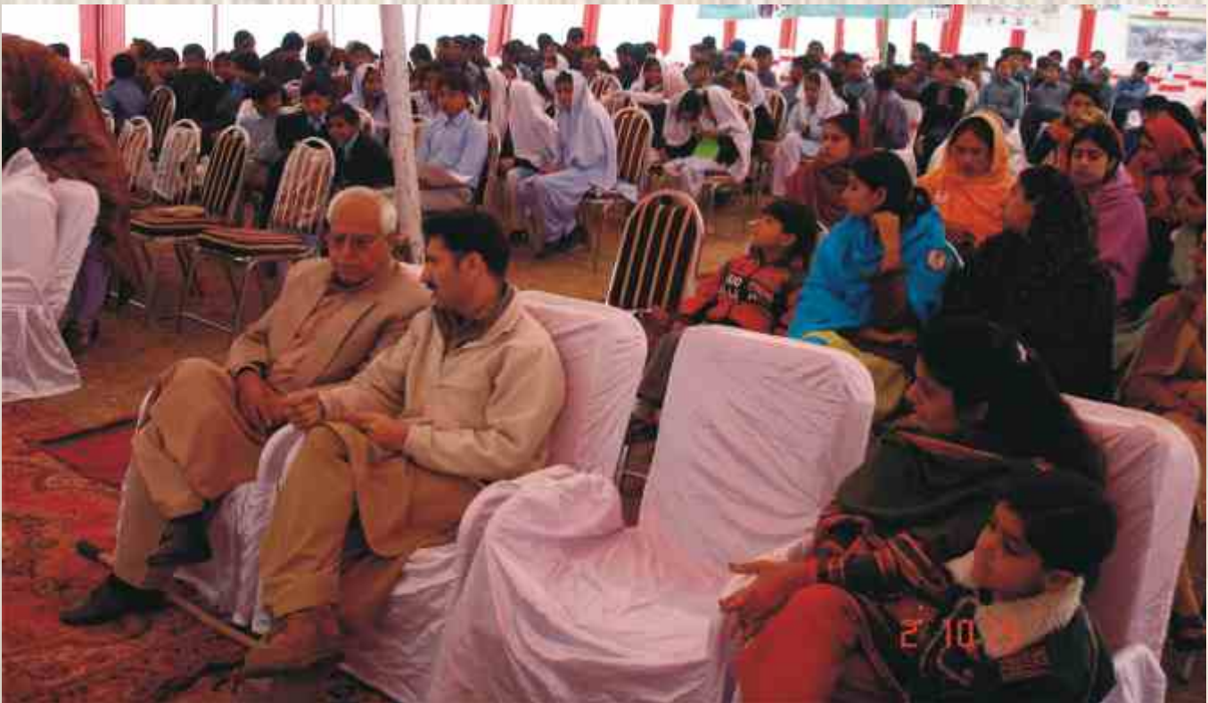
Guests seated at the occasion WWD 2008, CIWC.