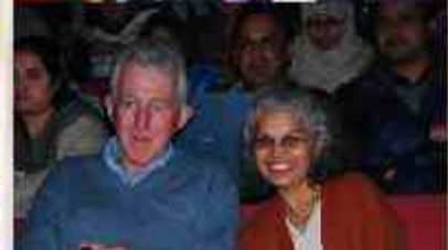
Honorable guests and PWP team members.