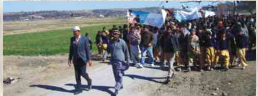
SRWC, Advocacy walk reaches Khabbeki Lake.

The Pakistan Wetlands Programme, Salt Range Wetlands Complex (SRWC) organised a Nature Walk and Bird Watching Activity at Khabbeki Lake on 12 th February. Over 300 students and staff members from Government High School, Khabbeki took part in the event.