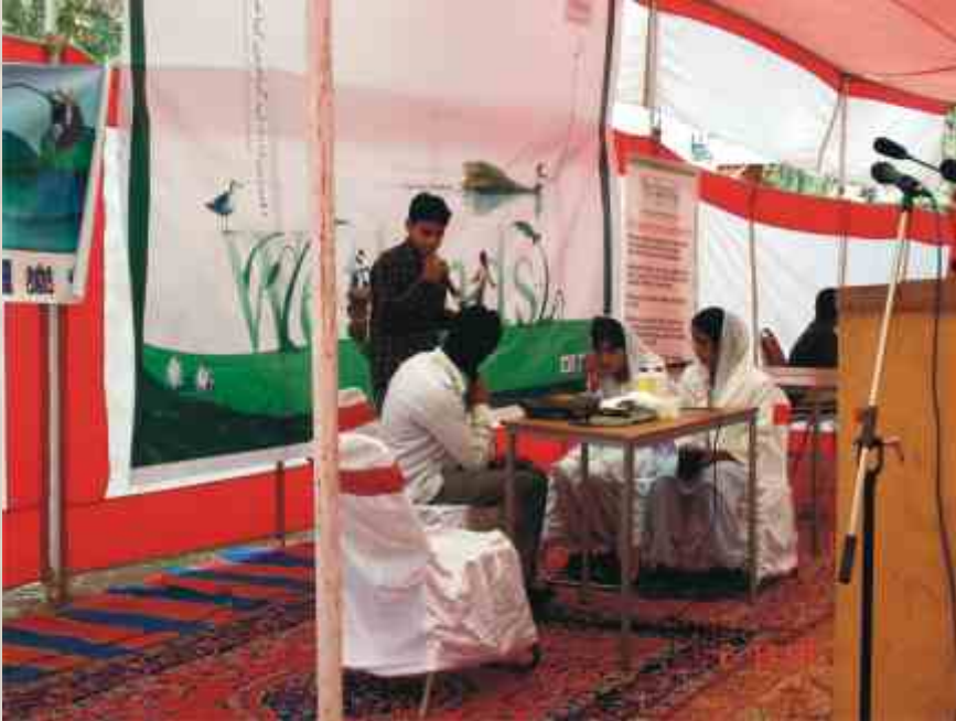
Play Performance on WWD 2008 at CIWC.

The Central Indus Wetlands Complex team celebrated the WWD 2008 with great enthusiasm. Various events and competitions were organised for the schools of District Rahim Yar Khan. The objective was to raise awareness among the young generations to