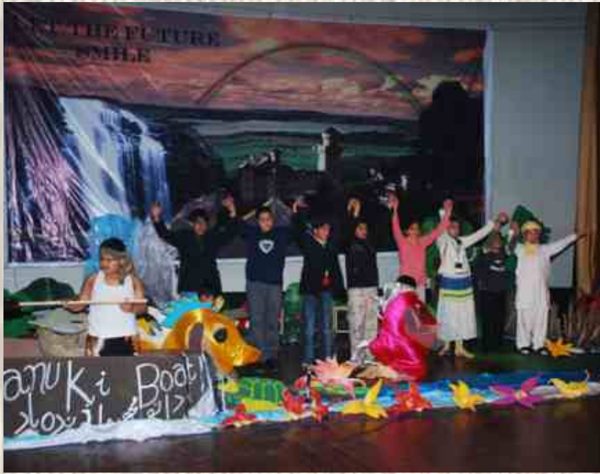
Play performance let the future smile.