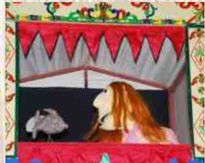
Puppets singing a wetlands song.

infotainment in awareness-raising, the PWP invited renowned puppeteers Rafi Peer Theatre Workshop from Lahore to present a