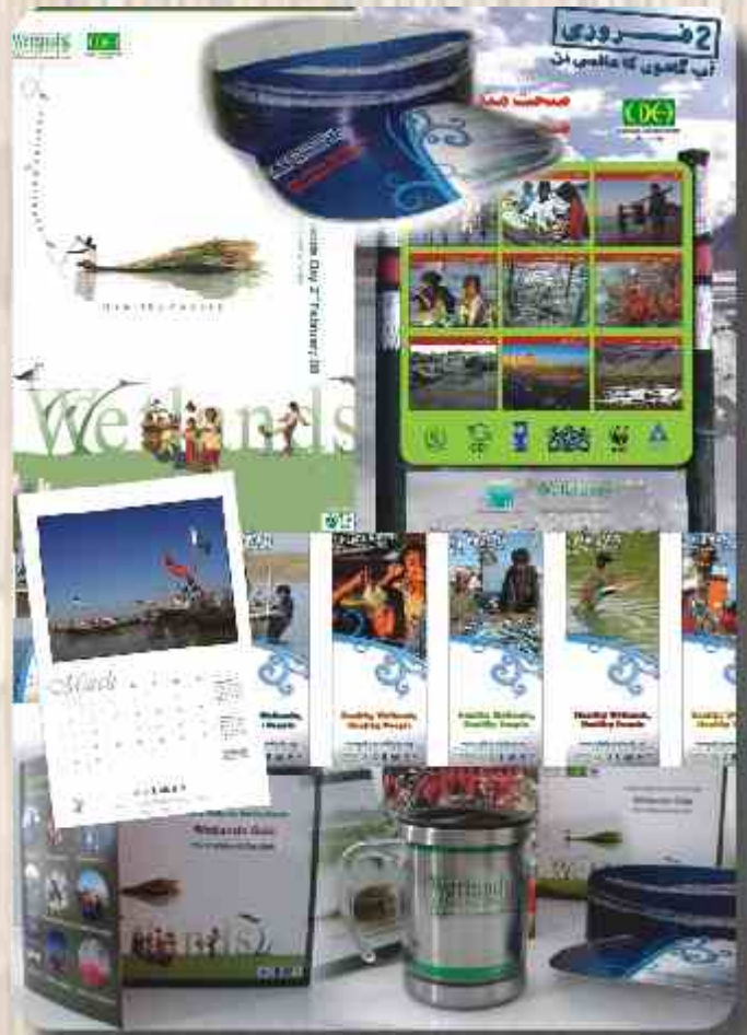
Some of the promotional material for WWD 2008.

Umeed Khalid , Conservator Wildlife, Ministry of Environment.