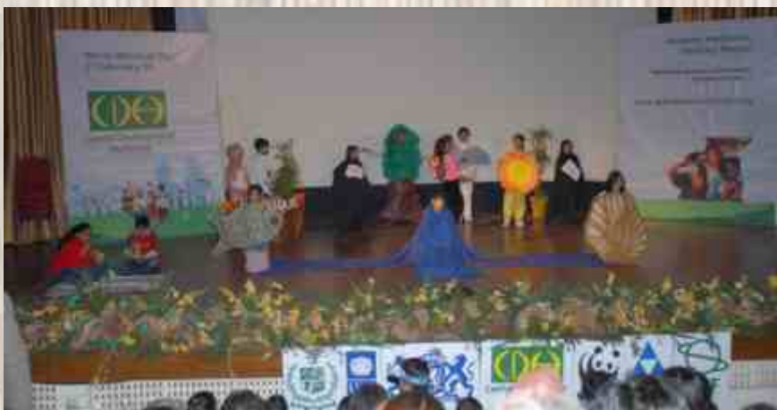
Play performance on wetlands and its associated biodiversity.

Geeli Zameen discussed how water logged soil could be made