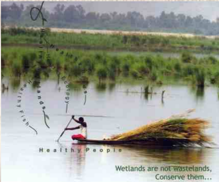
Screen shot of wetlands documentary.

Wetlands Complex, Salt Range Wetlands Complex, Central Indus Wetlands Complex, and Makran Coastal Wetlands Complex. It shows the diversity of wetland flora and fauna and the dependence of the local communities on wetlands resources.