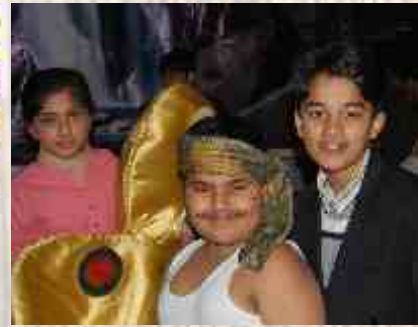
Young actors pose for snap.

suitable for irrigation. Wetlands are not wastelands and with proper management can be made useful, was the central theme of the play.