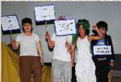
Play performance at Islamabad Club.

A lively and colourful play, Save the Wet by students of the Angelique School showed the negative