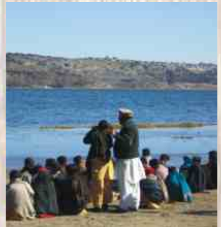
Bird watching at Khabbeki Lake.

and some tips were given on how to distinguish between various species of birds such as coot and