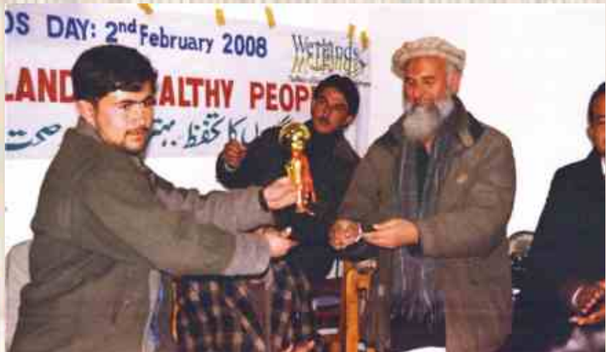
Prize distribution ceremony at NAWC.

Two presentations were given to students of The City School, Swat, to introduce the activities planned for WWD 2008 celebrations. This helped spark the interest of the students thereby leading to active participation in all the events especially the Arts Competition.