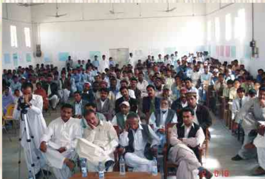
Audience assembled for WWD 2008 at District Assembly Hall, Gwadar.