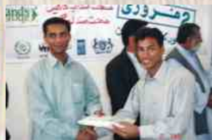
Prize distribution of WWD 2008.

the efforts of the PWP for striving to protect the wetlands and offered all kind of co-operation needed from