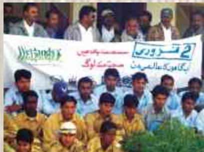
Ending ceremony advocacy walk at Jiwani, MCWC.

the MCWC organised a group discussion for the youth of Jiwani at the WWF-P Jiwani Conservation and Information Centre. A team of PWP gave short presentations on wetlands related topics such as the